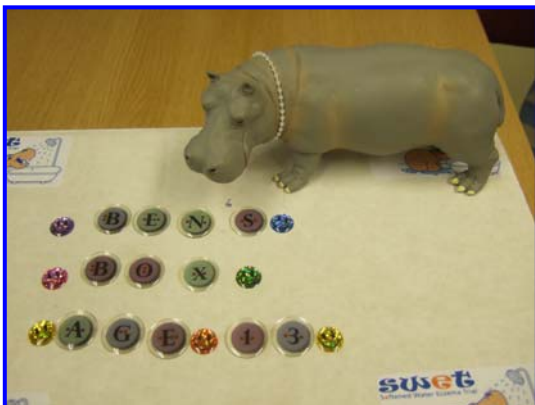
decorated by Ben, Isle of Wight, June 2007